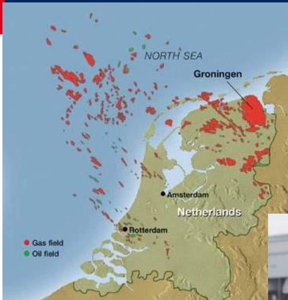
Productie Groningen gasveld